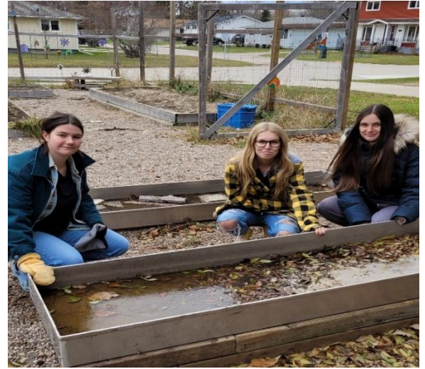
Youth in Philanthropy committee visited Gilbert School in October to view how the Junior Kindergarten used their grant for the outdoor classroom.