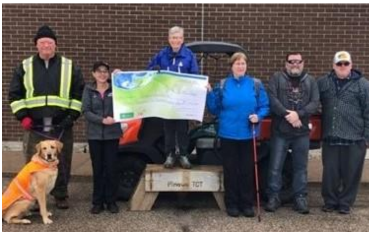
The Trans Canada Trail (TCT) Committee has been awarded the 2022 Greener Tomorrow Grant of $5,146 from Solo Market for trail maintenance. Our Pinawa TCT is 28 km long, stretching from the Seven Sisters Generating Station to the Old Pinawa Dam Provincial Park.